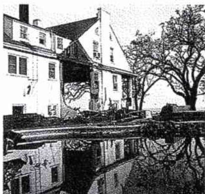
DISASTER RESPONSE Homeowners' claims satisfaction has improved since Katrina.

Our survey data contain good news and bad news about how insurance companies manage claims in the aftermath of a destructive hurricane. You're more likely